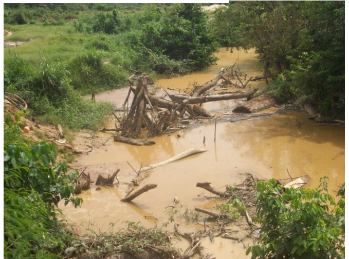
How the ONLY water body (river) has been POLLUTED by illegal miners

More of the event pictures can be found on our facebook page: www.facebook.com/StrategicYouthNetworkforDevelopment