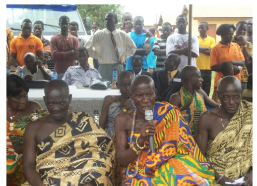
The Chief and some elders of Nwinso