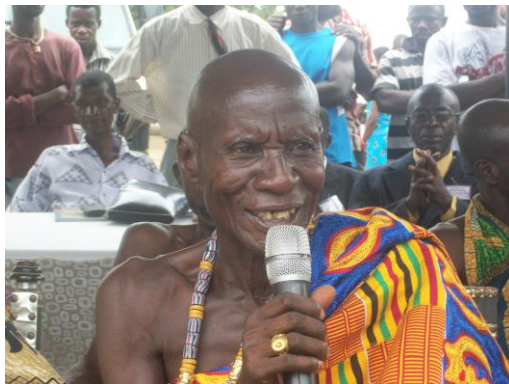
The Chief of Nwinso Community