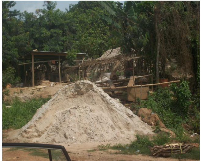
Galamsey operating machines at Nwinso Community