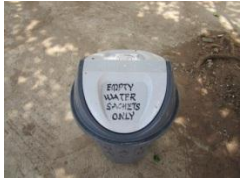
a dustbin designated for empty water sachets ONLY!

Strategic Youth Network for Development (SYND) is therefore appealing to all key stakeholders such as Government, Civil Society Organisations, Private Sector and Media to involve youth in all decision-making processes to ensure sustainable development. As future leaders, educating, sensitizing and/or empowering them are very critical for their inevitable roles as policy formulators, law enforcers and decision-makers.